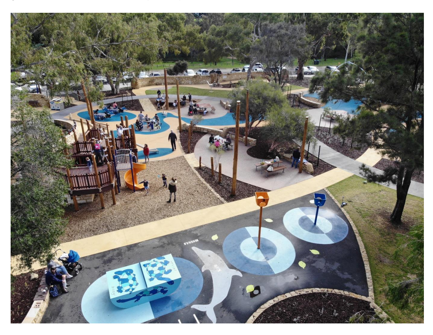
Image description: Families at Jo Wheatley All Abilities Play Space, Dalkeith