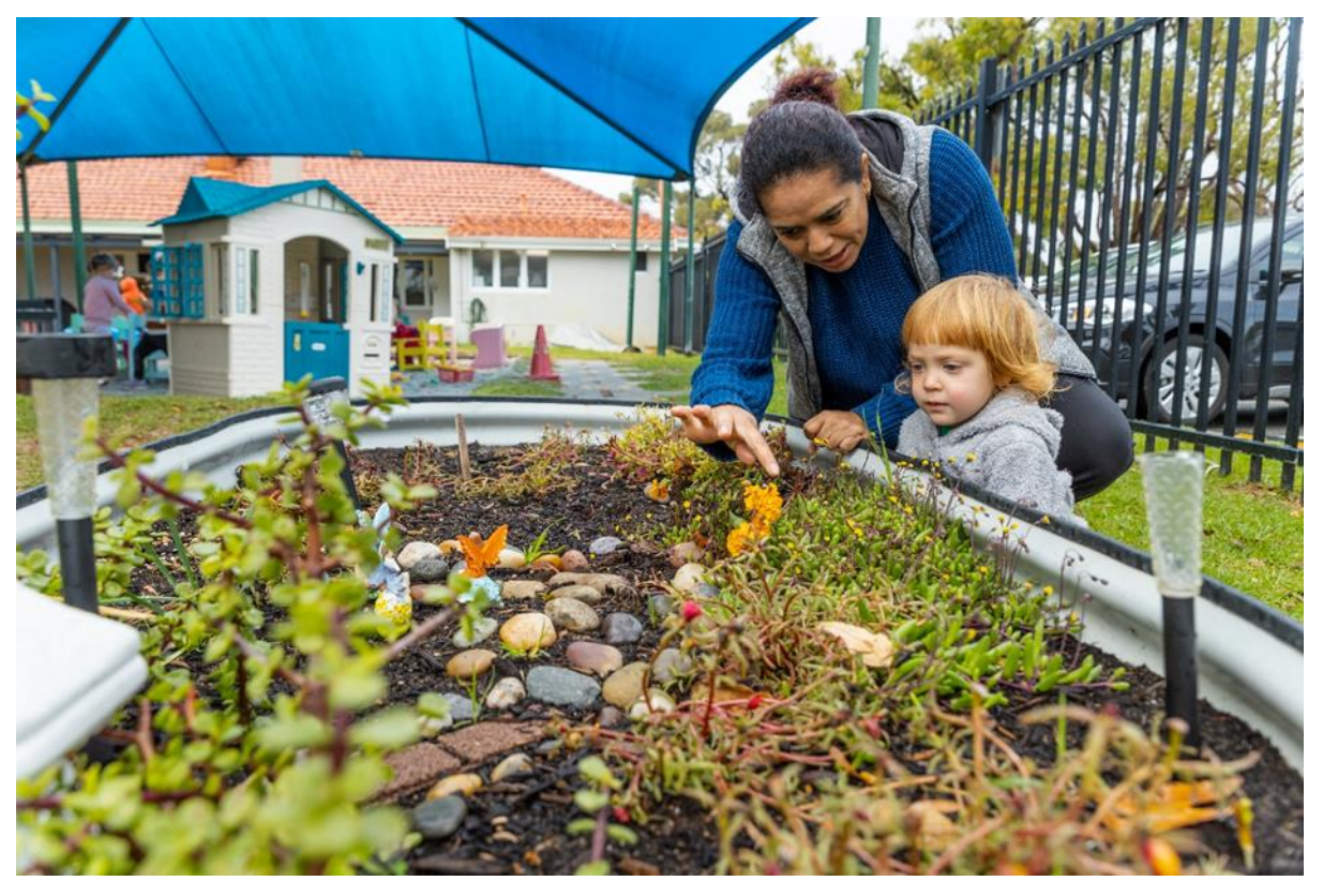
Image description: Youth development at Point Resolution Childcare Centre, Dalkeith.

Provide you with editable templates, including project logic model, implementation plan and community engagement plan.