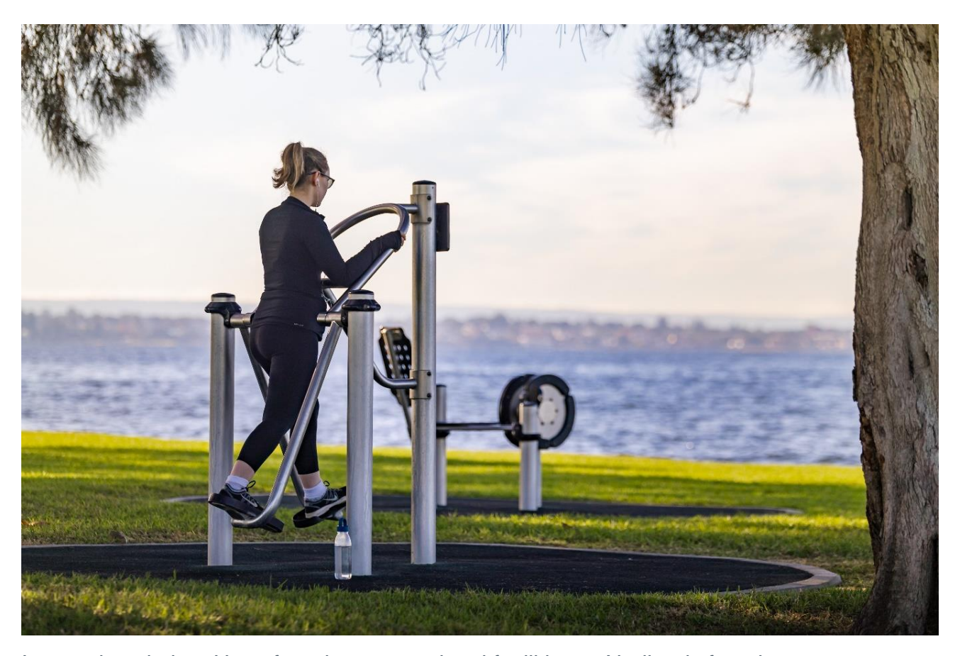
Image description: Use of outdoor recreational facilities at Nedlands foreshore.

Evaluation Framework and Implementation Guide