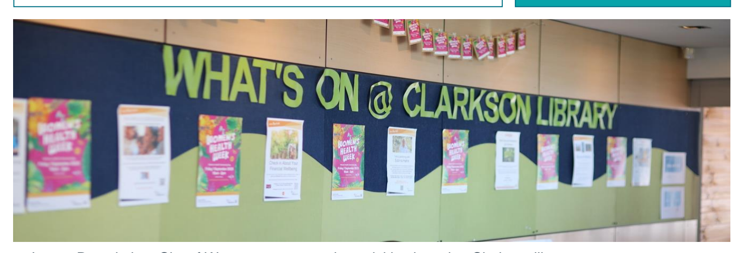
Image Description: City of Wanneroo community activities board at Clarkson library

Supply an action plan template that can be tailored to your LGAs needs.